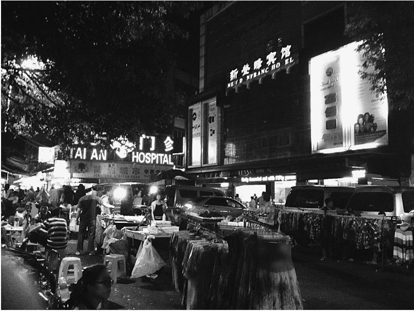
FIGURE 6. Vendors in front of New Don Franc Hotel

Kunming Railway Station, with twenty-nine Chinese murdered by Uyghurs, no doubt linked to the longstanding tension between Uyghurs and Han Chinese in Xinjiang Province. Later, Guangzhou Railway Station itself experienced an attack by knife-wielding Uyghurs, after which there was a government crackdown and all the Uyghurs vanished from Xiaobei, to practice their trades elsewhere. I never saw most of them again. 32