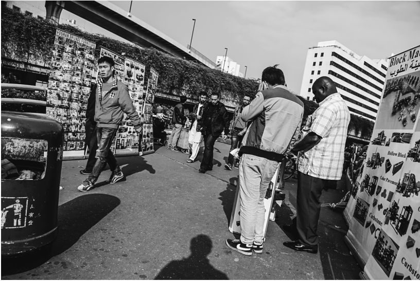
FIGURE 4. Interactions on Huanshi overpass

And in the Moka Café, the downstairs coffee shop, we have watched and listened to innumerable discussions and calculations in Arabic, French, Igbo, Swahili, Somali, Urdu, and very often in English, the primary language used between these different groups, over topics ranging from the fluctuations of exchange rates to the price of gemstones and sex workers to the costs and benefits for Muslims of having one, two, three, or four wives.