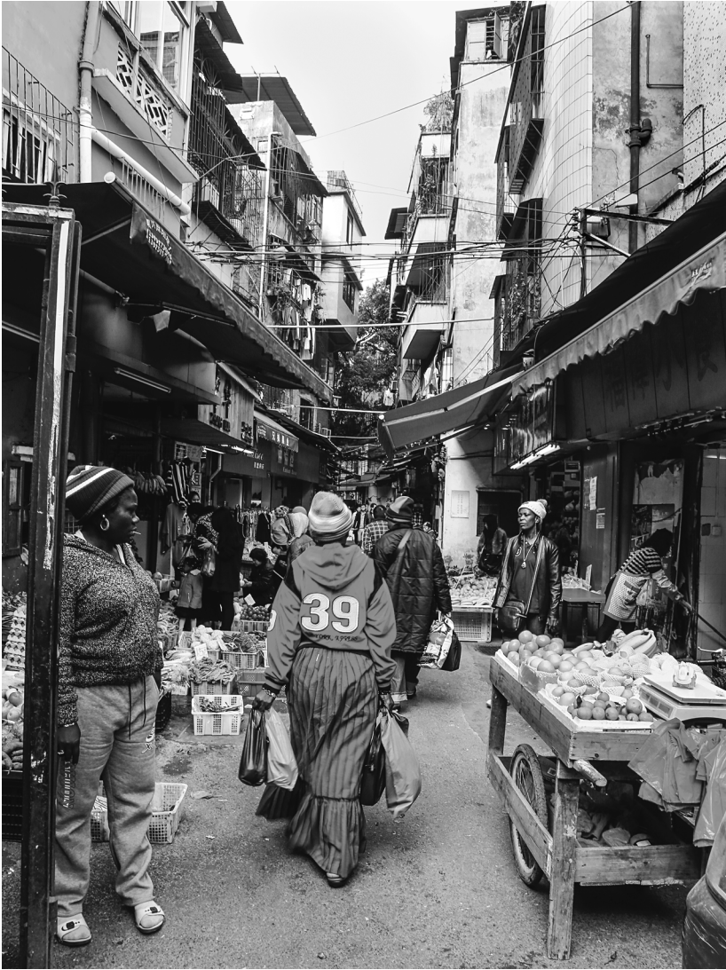
FIGURE 7. Baohan Street scene

street in all of China. There are a large number of self-proclaimed Islamic restaurants, and a few “African” restaurants on the street—meaning that they serve alcohol and thus are presumably Christian rather than Muslim. Partly because of the jet lag experienced by traders newly arrived from Africa, Baohan Street comes alive only in the evening, and it seems to never end—it is full of people until