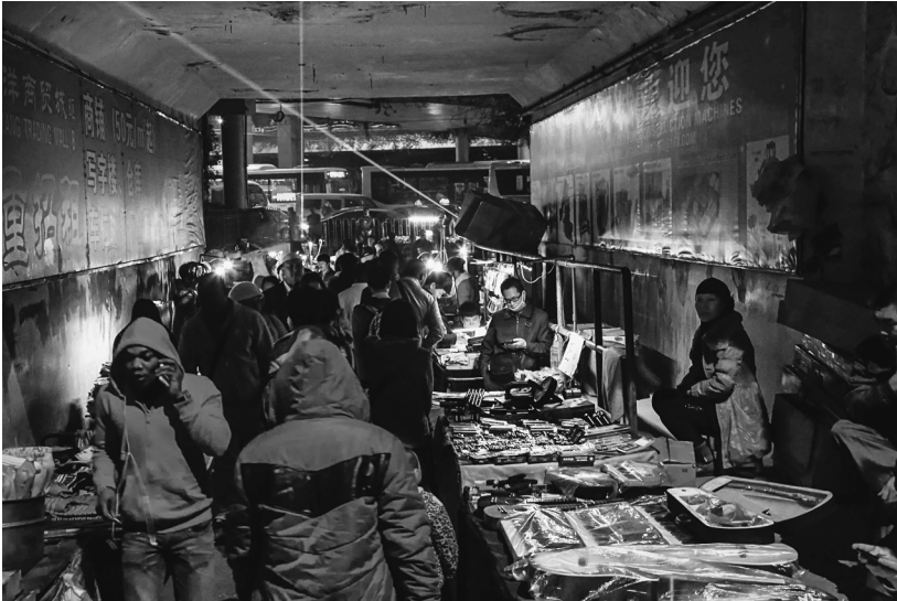
FIGURE 5. Vendors and customers in Xiaobei underpass

money changers in the plaza, gathering in the late mornings to exchange dollars and RMB; we have seen money changers walk away with four-inch-thick piles of US$10 and $20 bills. Traders go to them rather than to banks not only because their rates are competitive but also because no passports need to be shown. For overstayers without legal residence or for those who don't want to deal with the bureaucracy of Chinese banks, these money changers do their business.