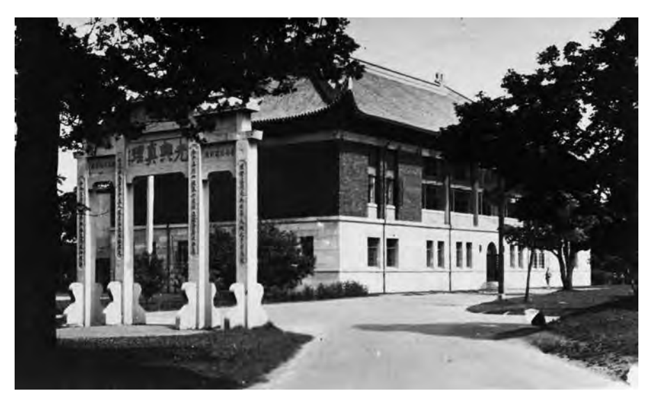
Figure 6 St. John's University Memorial Arch with Social Hall in background.

holy orders. The heart of the problem was the unresolved tension between the need for a well-trained clergy that was well formed in Anglican tradition and spirituality, and the absence of strong theological institutions with adequate funding and church and diocesan support.<sup>32</sup>