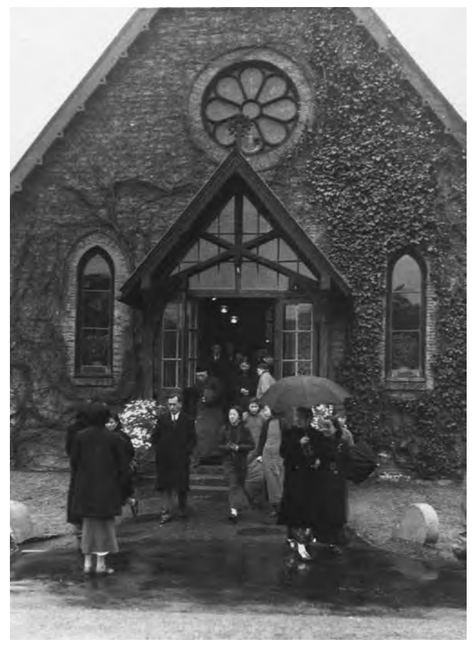
Figure 4 St. John's Pro-Cathedral, Shanghai, circa 1940.

The General Synod met ten times between 1912 and 1947, and in theory it oversaw and guided the CHSKH and all Anglican-Episcopal mission work in China. It sought to separate Anglican from "Englishness" and Episcopalian from "Americanness," so that a truly Chinese church could grow. In this, the CHSKH was never entirely successful. The missionary presence was always too strong, and important decisions were made in Canterbury, London, or New York. The otherness of the church—its foreign image—persisted. The missionaries were also in control in China. This was so even after the CHSKH was recognized at the Seventh Lambeth Conference in 1930 as an independent province, and thus part of the worldwide Anglican Communion. The missionary organizations continued alongside the church structure, and they were much more powerful and better organized. Foreign missionaries and missionary bishops held the purse strings and retained most of the important positions of leadership in church institutions.