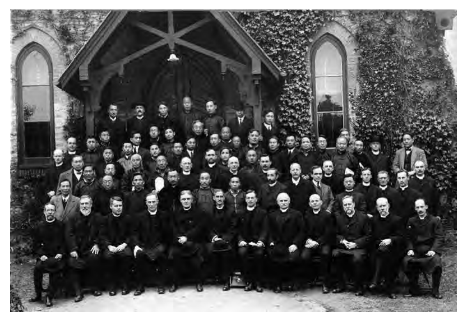
Figure 3 Chung Hua Sheng Kung Hui, First General Synod, April 1912.

(Shanghai, Hankow, and Wuhu [later named Anking]), five dioceses that were associated with the CMS (Victoria–South China, Fukien, West China [Sichuan], Chekiang, and Kwangsi-Hunan), two dioceses established by the SPG (North China and Shantung [Shandong]), and one diocese under the Church of England in Canada (Honan).<sup>24</sup>