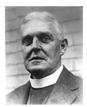
Figure 5 Bishop Frederick R. Graves (1858–1940).

After 1912 there were renewed efforts to write a prayer book in Chinese to replace translations of the various foreign prayer books. This proved to be a difficult task, however, because of regional language variations and individual missions' preferences.<sup>28</sup> English dioceses