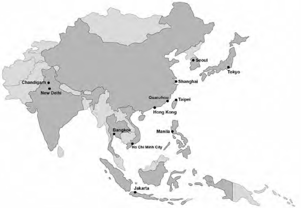
Figure 1.0 Case study sites. Illustration by Weijia Wang.