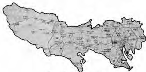
Tokyo Metropolis, Japan