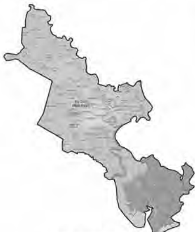
Ho Chi Minh City, Vietnam