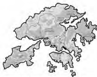
Hong Kong Special Administrative Region