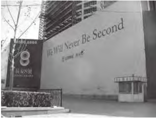
A billboard in Beijing advertising a new residential development trumpets, “We will never be second.”

America.” 17 Housing fairs, bustling expositions where developers promote their real estate, are carpeted with booths showcasing miniature dioramas of “Spanish” apartment complexes, “Mediterranean” villas, and “Rococo” townhouses.