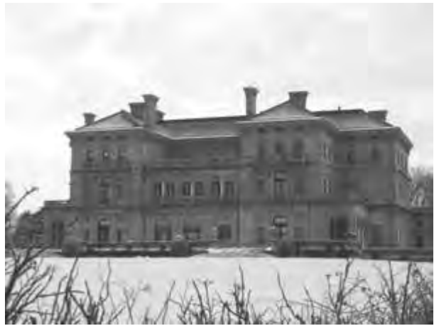
The Breakers, Cornelius Vanderbilt II’s Italian Renaissance style mansion (completed 1895). Newport, Rhode Island.