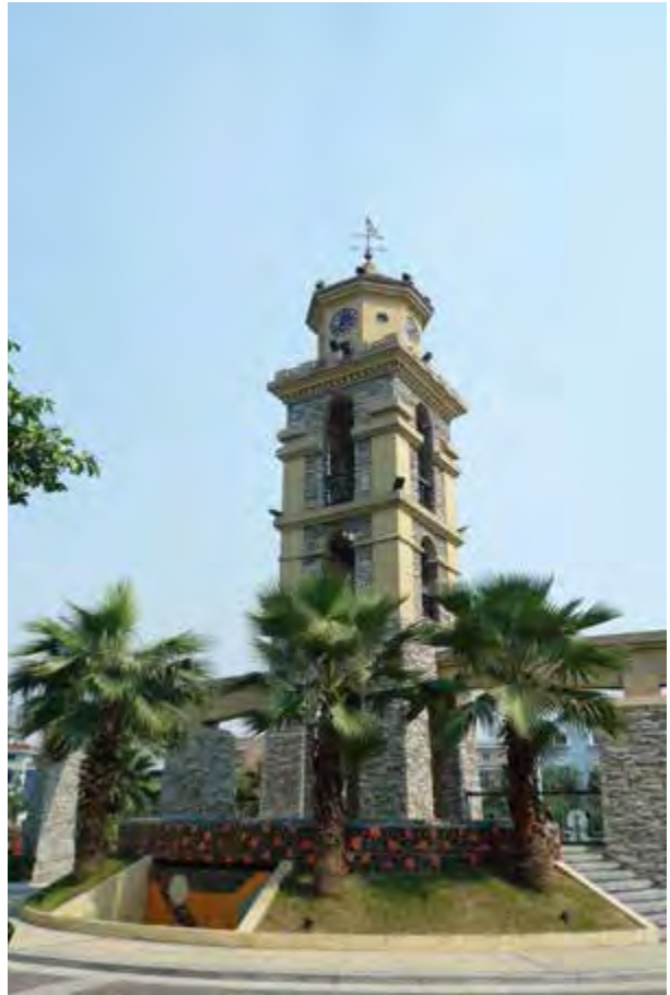
A large bell tower stands at the entrance to the Mediterranean-style Goya development in Hangzhou. The community is landscaped with palm trees, colorful mosaics, and terracotta tiles.

In an attempt to decipher the origins and implications of these simulacrascapes, this book will draw on architectural theory and criticism, historical attitudes toward imitation in China, and original, on-site research at the themed towns. Information about these themed developments, which consists of marketing materials, details on sales and prices, urban master plans, house designs, blueprints, and prospectuses about community life, was collected on multiple visits to these sites between July 2006 and October 2008. Descriptions and analysis of these environments are based, in part, on photo