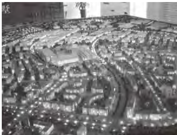
An expansive display of model homes in the Weimar Villas community stands at the center of a salesroom in Anting Town. A combination of villas, townhouses, and high-rises surrounds the town center, which includes a chapel, commercial units, and a school. Shanghai.

Significant portions of China's billions upon billions of square feet of new housing are contained within enclaves modeled on Western sites. In 2003, 70 percent of Beijing property developments emphasized Western architectural motifs, according to market research conducted at the time. 15 Li Yan, a designer with China's largest real estate developer, China Vanke, estimates that in 2008 the firm built approximately two-thirds of its residential properties in a European theme. 16 Real estate advertising and industry events directed to the newly affluent confirm the dominant position of these "fantasy" residences. Wallpapering the thoroughfares of Chinese cities, billboards advertising local residential developments are all but exclusively dedicated to airbrushed renderings of velvet and chandelier-bedecked living rooms and coax with promises of "royal living" in "the land of courtly enjoyment" or "the experience of seaside life of California in