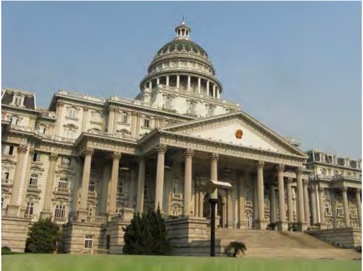
The Shanghai Minhang People's Court courthouse takes its inspiration from both the U.S. Capitol and the White House.

an urban theater in which the residents are coaxed into constructing a new Chinese identity. By so doing, the themed communities serve an important function of inculcating “global” urban behavioral modes and norms in a population fresh from the isolationist cultures of a discarded socialism.