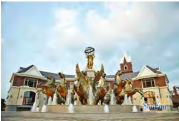
Fountains line the entrance to the English County development in Kunshan, which boasts to potential residents that its homes incorporate “classical English architectural concepts.”