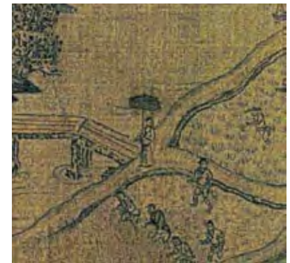
Fig. 1.15. Detail of "Shou yi" 收割 ("Reaping") from Genghuo tu 耕獲圖 ( Pictures of Tilling and Harvesting ). Thirteenth century. Album leaf, ink and light color on silk. Beijing: Collection of the Palace Museum.

右耕織圖二卷，耕凡二十一事，織凡二十四事。事為之圖，繫以五言詩一章，章八句四韻。樓璣當宋高宗時，令臨安於潛，所進本也。與豳風七月相表裡。其孫洪深等嘗以詩刊諸石。其從子鑰嘉定間忝知政事，為之書丹，且敘其所以。此圖亦有木本流傳于世。文簡程公曾孫榮儀甫博雅君子也。繪而篆之以為家藏，可謂知本覽者毋輕視之。吳興姚式書 36