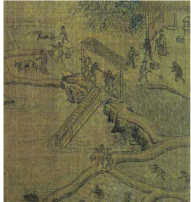
Fig. 1.11. Detail of "Guan gai" 灌溉 ("Irrigation") from Genghuo tu 耕獲圖 ( Pictures of Tilling and Harvesting ). Thirteenth century. Album leaf, ink and light color on silk. Beijing: Collection of the Palace Museum.

Since the Freer Pictures of Weaving present the twenty-four scenes of Lou Shu's Pictures of Weaving in a sequence that corresponds with the description in the Lou family documents of 1210, I take it to be closer to the original than the Heilongjiang scroll with its diversions from the sequence. The Heilongjiang scroll may be the older painting, but it appears that it does not faithfully represent the older iconography as transmitted by the textual records of 1210. An analysis of the corpus of early pictures of tilling and weaving suggests that the iconography of the Freer paintings dates to the mid-twelfth century, though the scrolls themselves most likely date to the eighteenth century.