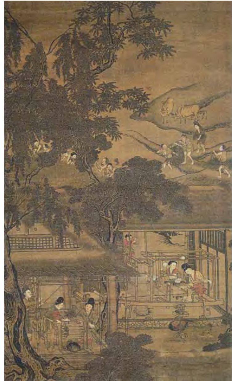
Fig. 1.7. Gengzhi tu 耕織圖 ( Pictures of Tilling and Weaving ). Possibly twelfth century. Hanging scroll, ink and light color on silk, 25.7 x 24.8 cm. Shanghai: Museum of Art.