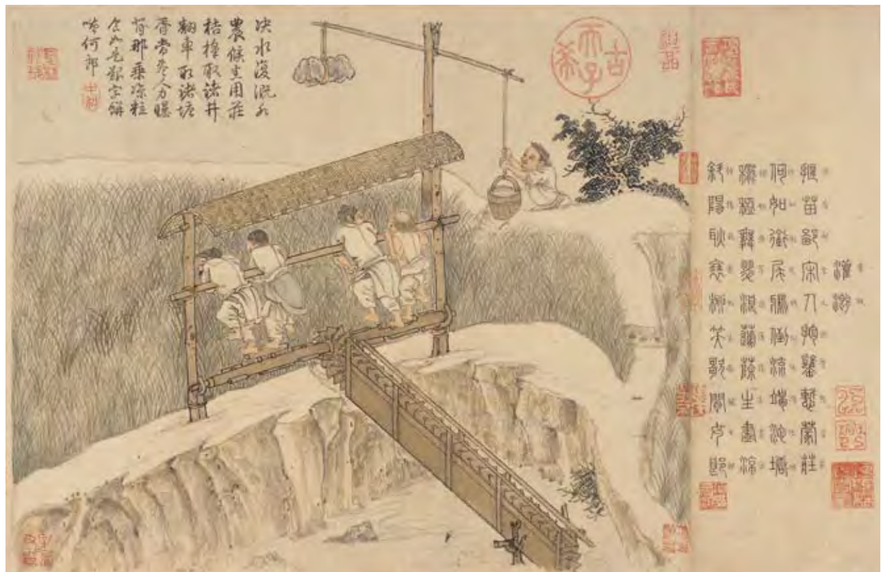
Fig. 1.10. Attributed to Cheng Qi 程棨 (act. c. 1275). Scene of “Guan gai” 灌溉 (“Irrigation”) from Gengzuo tu 耕作圖 ( Rice Culture ). Later copy, possibly eighteenth century. Handscroll, ink and color on paper. Washington, DC: Freer Gallery of Art, Smithsonian Institution (Purchase, F1954.21).

two works. 31 In some cases the entire composition is close, though they are occasionally mirror images, in others it is the postures of the working women, or the number of figures and the placement of equipment within the vignettes that is nearly identical. In both scrolls, for instance, the scene for the “Second Molting” features two women and a baby in a room with a vertical case of trays (figs. 1.18 and 1.19). The poses of the women and child are identical: a standing woman holds a child out towards a seated woman, who reaches toward the infant as if to receive it in her arms. In both scenes the tray holder behind the seated woman on the right supports the flat baskets brimming with silkworms and chopped mulberry leaves.