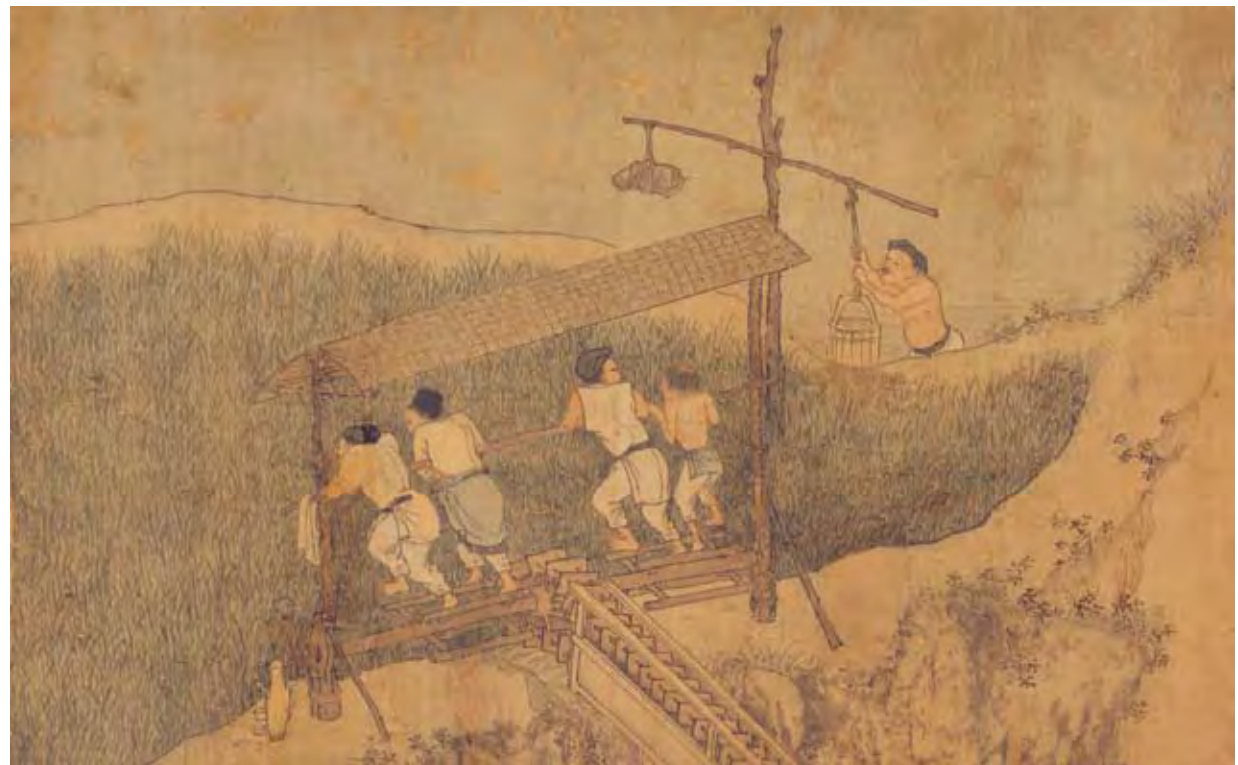
Fig. 1.9. Qugeci (Hugechi) 忽哥赤 (act. mid-fourteenth century) and Yuan artist (fourteenth century). Scene of “Guan gai” 灌溉 (“Irrigation”) from Gengjia tu 耕稼圖 ( Pictures of the Hard Labor Involved in Tilling ). Fourteenth century. Handscroll, ink and color on silk. New York: The Metropolitan Museum of Art (Purchase, W. M. Keck Foundation Gift and other gifts in memory of Douglas Dillon, 2005, 2005.277).

The iconography of the Freer and Metropolitan scrolls is also consistent with the miniaturized scenes in the Song fan painting. Its “Irrigation” scene (fig. 1.11) also displays four people pedaling the pump in poses similar to those found in the Metropolitan and Freer scrolls, albeit reversed. We do not see the man working a lever to the side, and the small scale of the painting makes it impossible to distinguish whether or not a woman is working alongside the men. In all three paintings the pumps are shown in the field in nearly identical fashion. Indeed, with the exception of the omission of “Seeding” (Step 6) in the fan’s sequence (fig. 1.6),