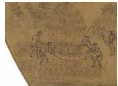
Fig. 1.12. Detail of "Chi sui" 持穗 ("Threshing") from Genghuo tu 耕獲圖 ( Pictures of Tilling and Harvesting ). Thirteenth century. Album leaf, ink and light color on silk. Beijing: Collection of the Palace Museum.