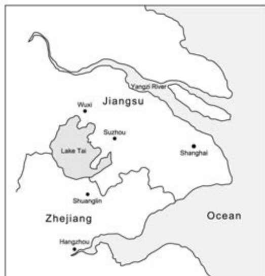
Figure 1 Map of Shanghai region

Tsar Teh-yun (or Cai Deyun) 1 was born, according to the Chinese lunar calendar, on the 30th day of the tenth month, 1905 (November 26th in the Gregorian calendar), in the town of Shuanglin in Huzhou county, Zhejiang province, a town where her parents' families had lived for many generations. Shuanglin is near the border of Jiangsu province, and about ten miles south of Taihu (Lake Tai), the third largest fresh-water lake in China near its eastern seaboard. (See Figure 1.) Huzhou county is situated in the heart of the Suzhou-Hangzhou axis; the two historic cities and the surrounding region have long been celebrated for their prosperity and for being centers of literati culture. It is no wonder that a popular saying goes, "Up above there is heaven, down below there are Suzhou and Hangzhou." Huzhou county itself is celebrated for its high-quality ink brushes and rice paper for painting and calligraphy, industries that grew out of the literati culture. 2